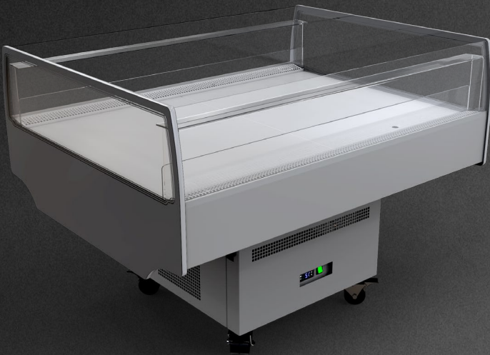
Fiji LDFI-21 1000 BCA